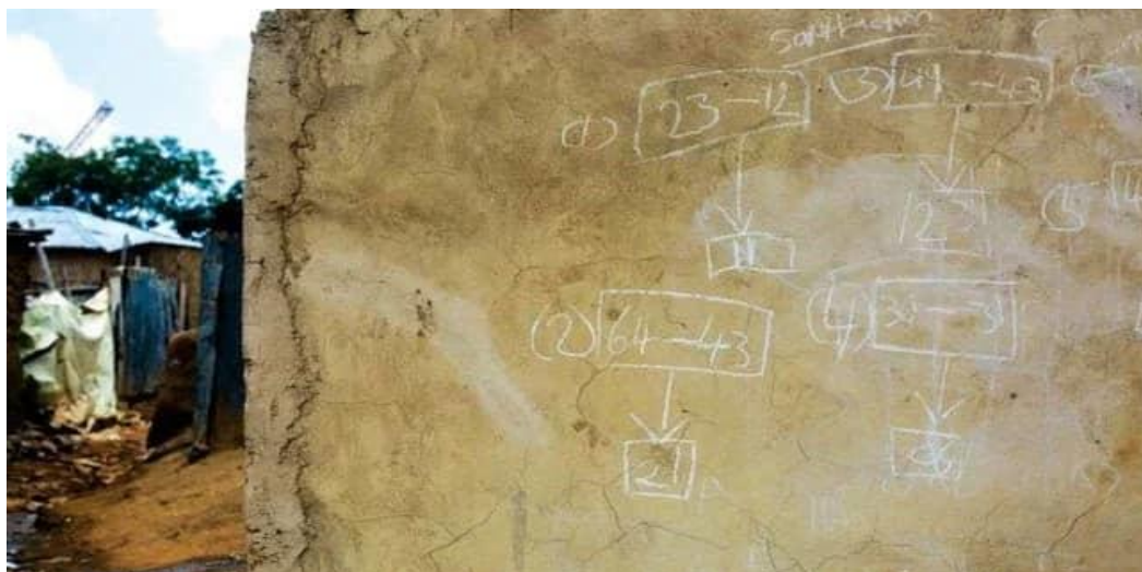
Figure 2: A wall converted for learning process.