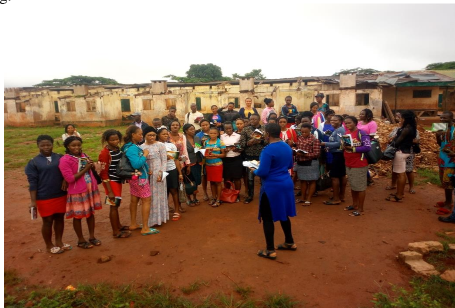
Figure 4: A photogra phy of both the learners and instructor during learning process.