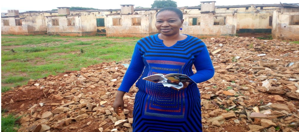
Figure 3: A photography of a dilapidated classroom.