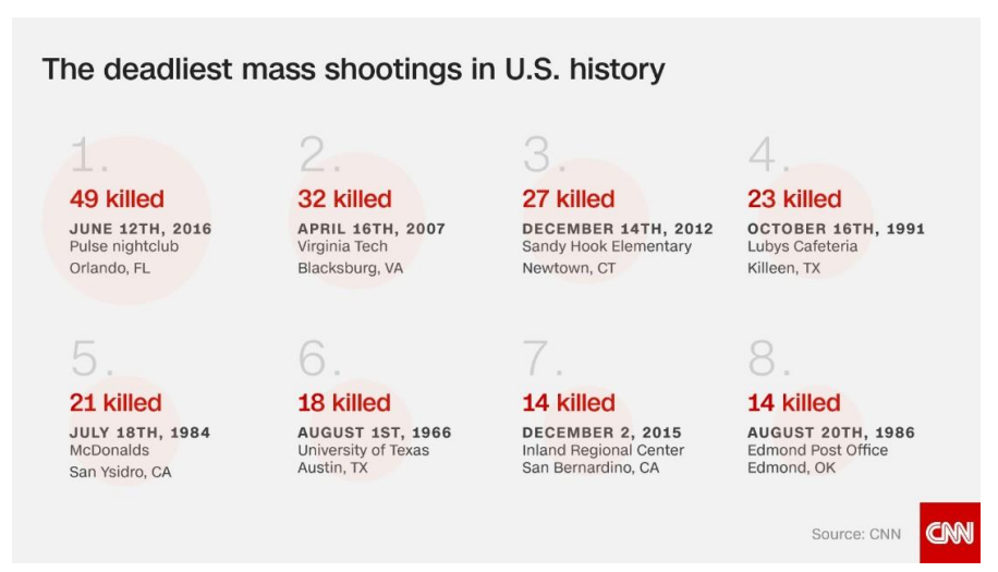
Figure 2. Adapted from "Deadliest Mass Shootings in US History Fast Facts," 2017.

An example is that since 2013, over 233 school shootings occurred, and mass school shootings were labeled as becoming the 'norm' in the United States (Fantz, 2014). There is nothing normal about children sitting in classrooms and being shot by random gunfire. Fatal and nonfatal injuries resulted from a history of mass school shootings in the United States.